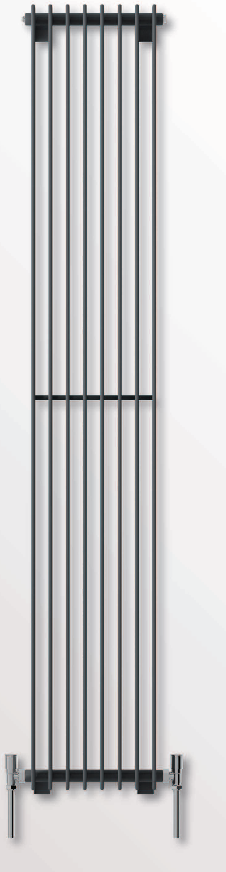
Verona Slimline Concept