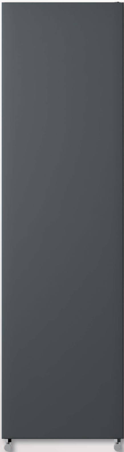
Plan Vertical Concept