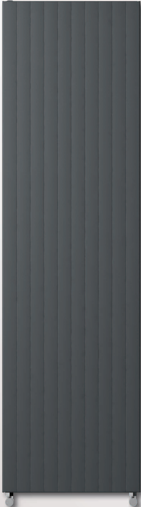
Alto Line Vertical Concept