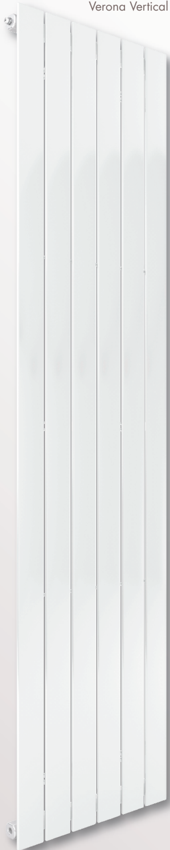
Verona Vertical Single